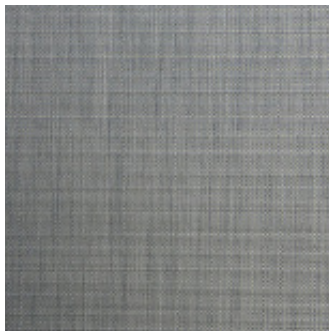
Cambridge Steeple Grey