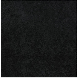
City Club Onyx