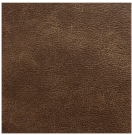
City Club Brumby