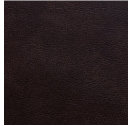
City Club Shiraz