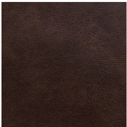
City Club Sienna