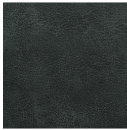
City Club Gunmetal