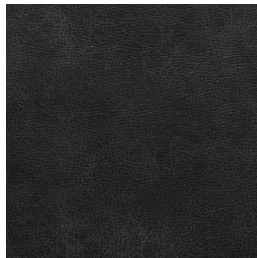
City Club Smoke