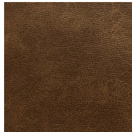
City Club Tan