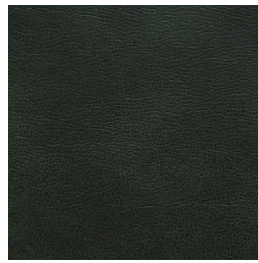
City Club Hunter