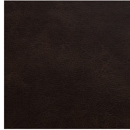
City Club Saddle