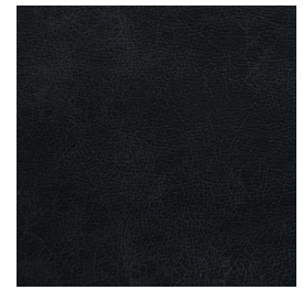
City Club Midnight