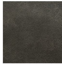
City Club Marble