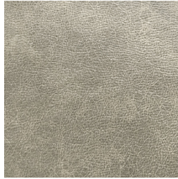
City Club Oyster