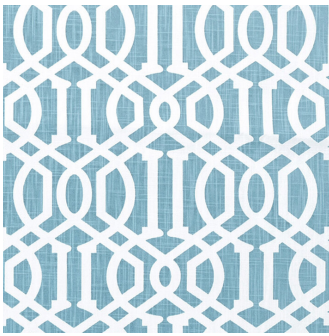
Lattice Duck Egg