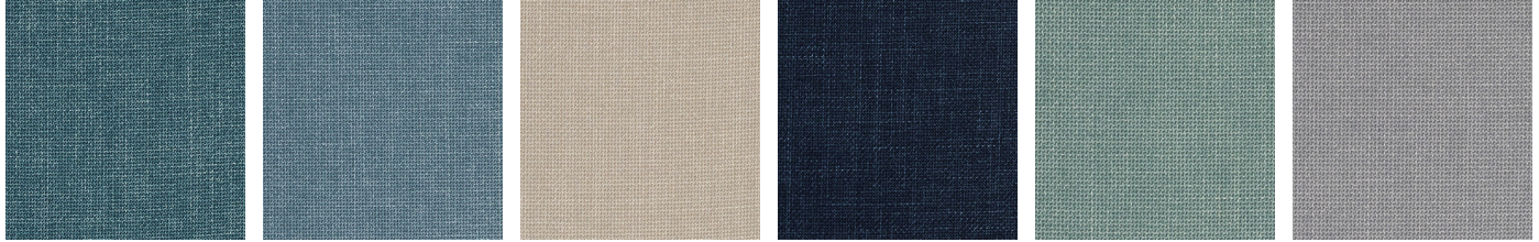
Jasper Lagoon Marble Marine Mint Nickel